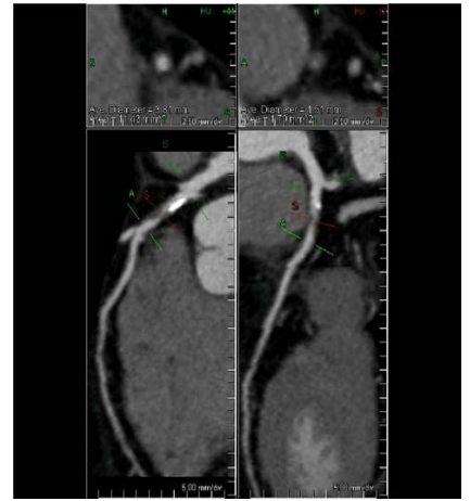
Obstructive disease proximal LAD

NRAD is pleased to offer Cardiac CT Angiography at our 711 Stewart Avenue office in Garden City. Our state of the art Siemens Dual Source 128 slice CT scanner enables us to perform studies without B-blockers, utilizing dose modulation to minimize radiation dose to your patient. All exams are interpreted by radiologists who are Board Certified in cardiac CT and/or have completed Level II training in cardiac CT.